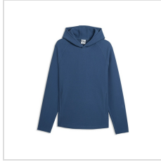
Dark Indigo (632267-08)