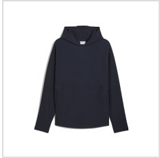
Deep Navy (632196-01)