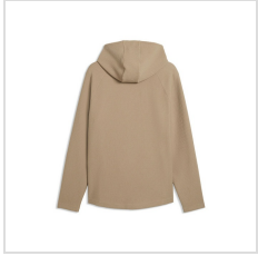
Ice Coffee (632196-09)