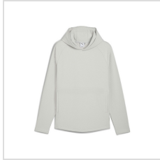
Ash Grey (632196-05)