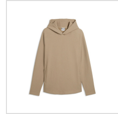
Ice Coffee (632196-09)