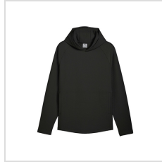
Puma Black (632196-06)