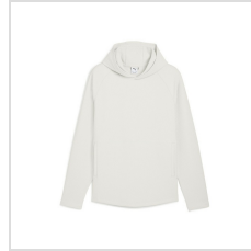
Warm White (632196-07)