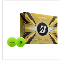
Matte Green (5CGYN)