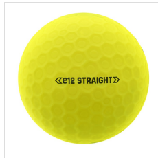
Matte Yellow (5CYYN)