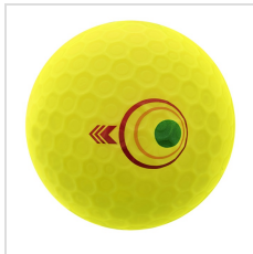
Matte Yellow (5CYYN)