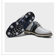
White/Pageant Blue/Denim (54563)