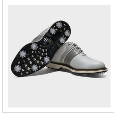
White/Steel Grey/Gunmetal (54562)