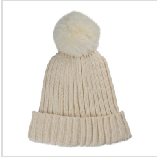
Callaway Ladies Extended Season Beanie