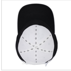
Inner Lining View (5222232)