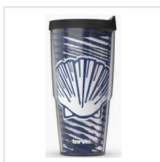
Tervis Tumbler with 360° Custom Wrap