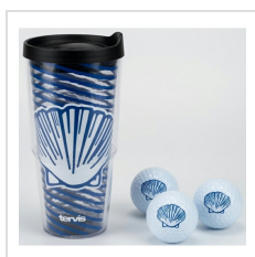
Tervis Tumbler with 360° Custom Wrap & Golf Balls