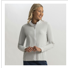
Oyster Grey (38964)