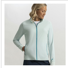
Glacial Blue (38963)