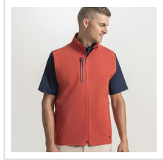
Nantucket Red (38859)