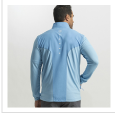
Blue Reef (38855)