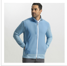
Blue Reef (38855)