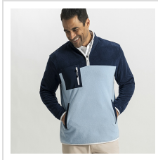
Navy/Light Blue (38847)