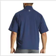
FootJoy Short Sleeve Zephyr Windshirt