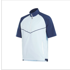
Navy/Light Blue (37732)