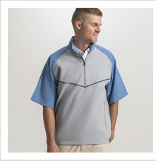
Coastal Blue/Grey (38845)