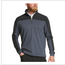
Black/ Charcoal (36885)