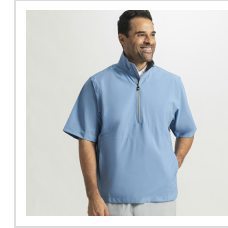
Coastal Blue/Graphite (38853)