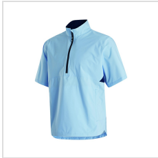
Light Blue/Navy (37695)