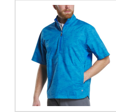
Blue Camo (33360)