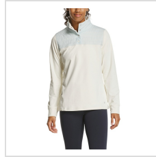
Off White/Ice Blue (36851)