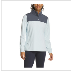
Ice Blue/Charcoal (36850)