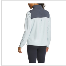
Ice Blue/Charcoal (36850)