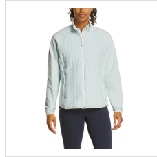
Ice Blue (36844)