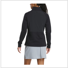
FootJoy Ladies Hybrid Quarter-Zip*