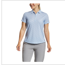
Blue Jay/White (33453)