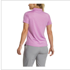
FootJoy Ladies Speckle Short Sleeve Print Shirt