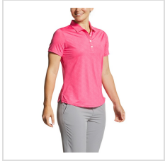
Pink Lemonade/White (33457)