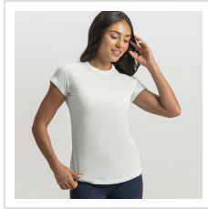
Glacial Blue (38941)