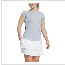
Heather Grey (33451)