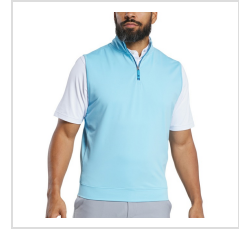
Light Blue (33302)