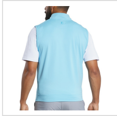
FootJoy Approach Quarter-Zip Pullover Vest (Gathered Waist)