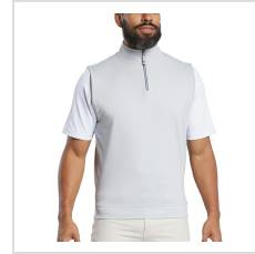
Heather Grey (33301)