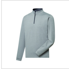
Heather Grey (30486)