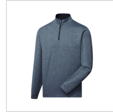
Heather Charcoal (28233)