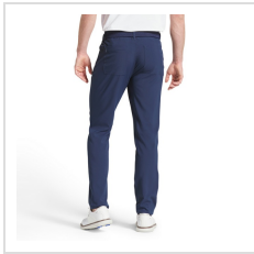
FootJoy Moxie 5-Pocket Pants