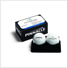
Pinnacle Distance White (P4034E-2BC)