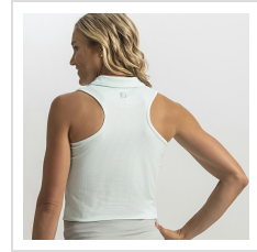
Glacial Blue (38927)