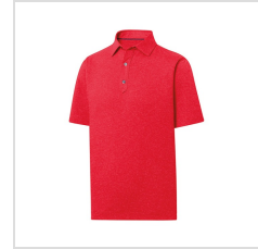
Heather Red (28568)