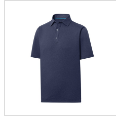
Heather Navy (28567)