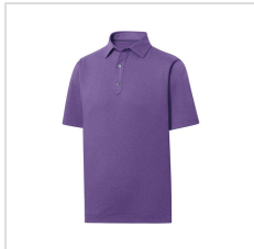
Heather Violet (28570)