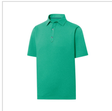
Heather Spearmint (28572)