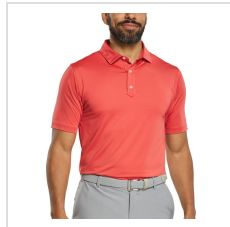
Nantucket Red (35415)