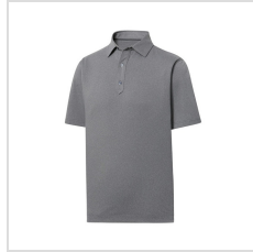
Heather Charcoal (28558)