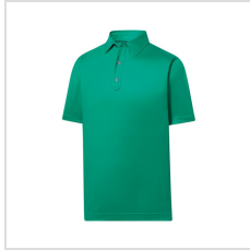
Forest Green (28565)