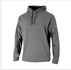
Heathered Cool Grey (26S51ML-970)