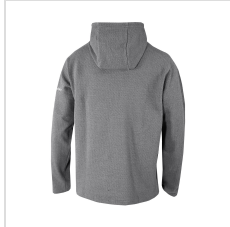
Heathered Cool Grey (26S51ML-970)