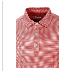
Intense Red (26S08MP-610)