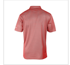
Intense Red (26S08MP-610)