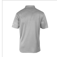
Cool Grey (26S08MP-019)