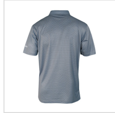
Collegiate Navy (26S08MP-464)