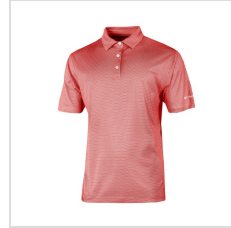
Intense Red (26S08MP-610)