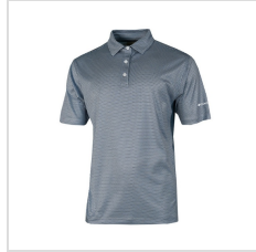
Collegiate Navy (26S08MP-464)