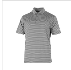
Cool Grey (26S01MP-019)