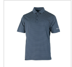
Collegiate Navy (26S01MP-464)