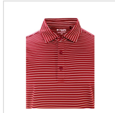
Intense Red (26S01MP-610)