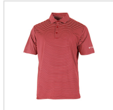
Intense Red (26S01MP-610)