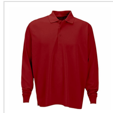
Sport Red (2602-SRE)