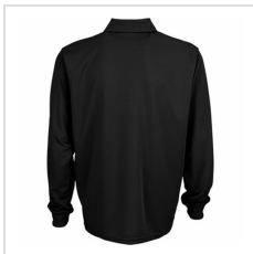
Vansport Omega Long Sleeve Solid Mesh Tech Polo*