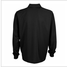
Vansport Omega Long Sleeve Solid Mesh Tech Polo*