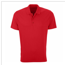
Real Red (2600-RRE)