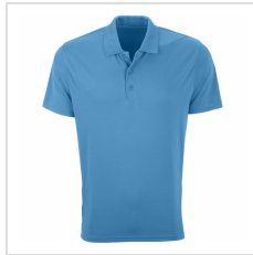
Carolina Blue (2600-CLB)