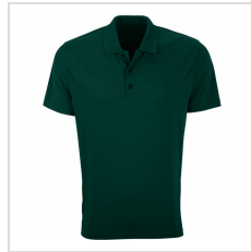
Dark Forest (2600-DFR)