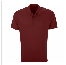
Deep Maroon (2600-DMR)