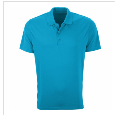
Island Blue (2600-ISL)