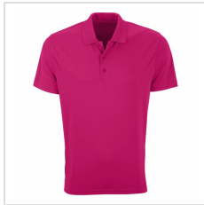
Berry Pink (2600-BPK)