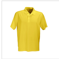
Athletic Gold (2600-AGD)