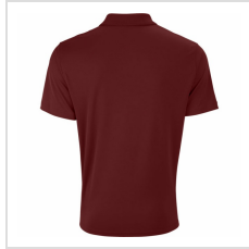
Vansport Omega Solid Mesh Tech Polo*