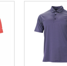
UW Purple (25S30MP-559)