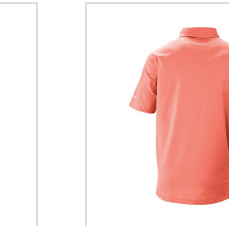
State Orange (25S30MP-842)