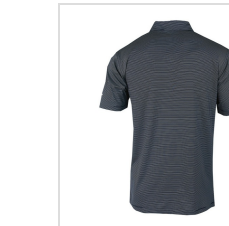
Collegiate Navy (25S30MP-464)