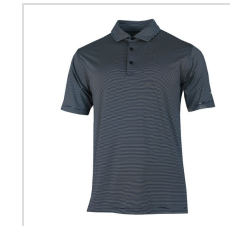
Collegiate Navy (25S30MP-464)