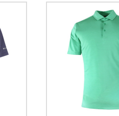
Glaze Green (25S30MP-307)