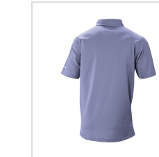
Frosted Purple (25S30MP-301)