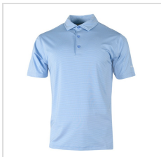
White Cap (25S30MP-450)