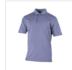
Frosted Purple (25S30MP-301)