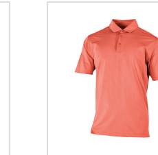
State Orange (25S30MP-842)