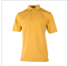
Aztec Gold (25S30MP-224)