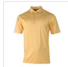
Cocoa Butter (25S30MP-171)