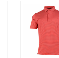
Intense Red (25S30MP-610)