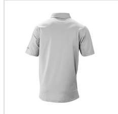
Cool Grey (25S30MP-019)