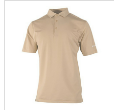
Vegas Gold (25S30MP-170)