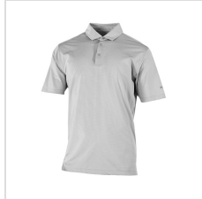
Cool Grey (25S30MP-019)