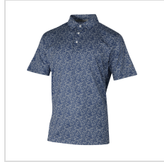
Collegiate Navy (25S26MP-464)