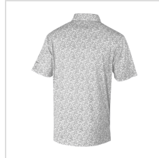
Cool Grey (25S26MP-019)