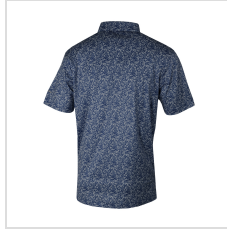
Collegiate Navy (25S26MP-464)