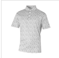
Cool Grey (25S26MP-019)