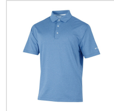
White Cap (25F34MP-450)