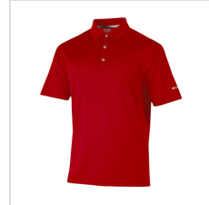
Intense Red (25F34MP-610)