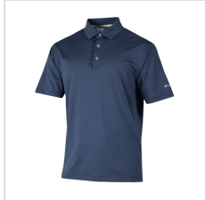
Collegiate Navy (25F34MP-464)