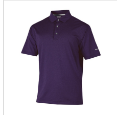
UW Purple (25F34MP-559)