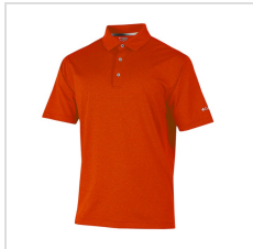
State Orange (25F34MP-842)