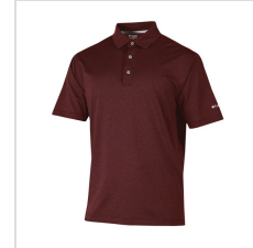
Deep Maroon (25F34MP-699)