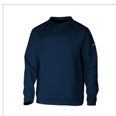
Collegiate Navy (25F16ML-464)