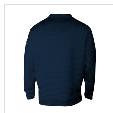
Collegiate Navy (25F16ML-464)