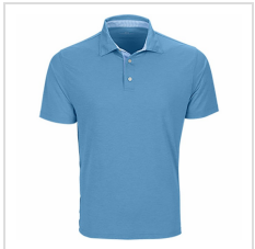
Carolina Blue (2460-CLB)