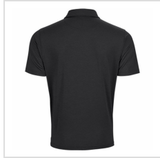
Vansport Pro Signature Polo