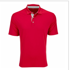
Sport Red (2460-SRE)