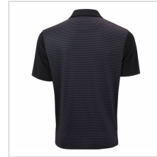
Vansport Pro Highline Polo*