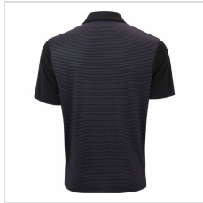
Vansport Pro Highline Polo*