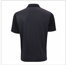
Vansport Pro Highline Polo*