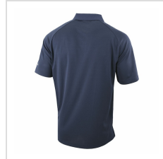
Dark Mountain (23S42MP-478)