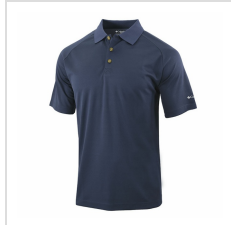
Dark Mountain (23S42MP-478)