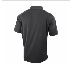
Forged Iron (23S42MP-895)