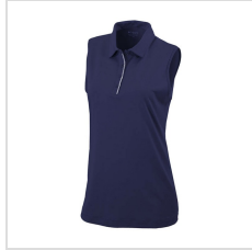
Collegiate Navy/White (23S27WP-464)