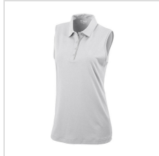
White/Cool Grey (23S27WP-100)