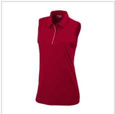
Intense Red/White (23S27WP-610)