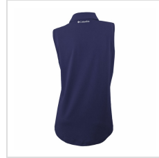
Collegiate Navy/White (23S27WP-464)