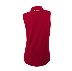
Intense Red/White (23S27WP-610)