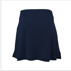
Collegiate Navy (23F51WB-464)