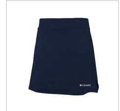
Collegiate Navy (23F51WB-464)