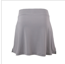
Cool Grey (23F51WB-019)