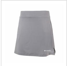
Cool Grey (23F51WB-019)