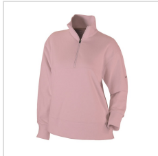
Cherry Blossom (23F05WL-601)