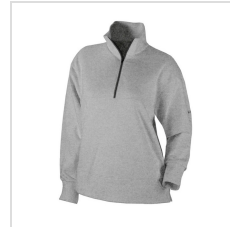
Heather Cool Grey (23F05WL-970)