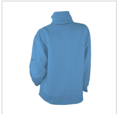
Agate Blue (23F05WL-453)