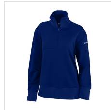
Collegiate Navy (23F05WL-464)