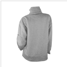
Heather Cool Grey (23F05WL-970)