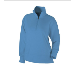
Agate Blue (23F05WL-453)