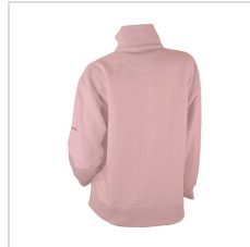
Cherry Blossom (23F05WL-601)