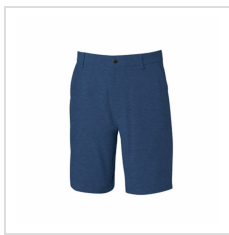
Heather Navy (26818)