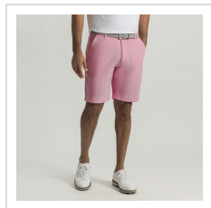
Pink Pop (39652)