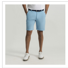
Blue Reef (39651)