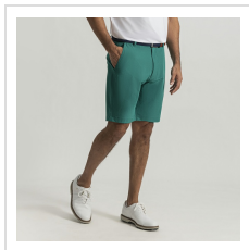
Field Green (39653)