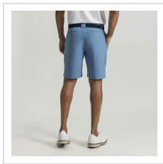
Coastal Blue (39650)