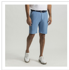
Coastal Blue (39650)