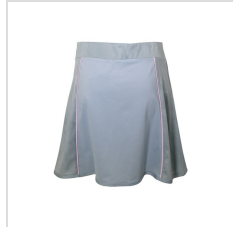
Cirrus Grey (22S19WB-012)