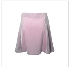
Pink Dawn (22S19WB-677)