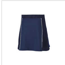
Collegiate Navy (22S19WB-464)