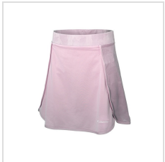
Pink Dawn (22S19WB-677)