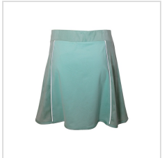
Icy Morn (22S19WB-312)