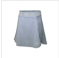
Cirrus Grey (22S19WB-012)