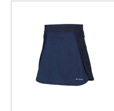
Collegiate Navy (22S19WB-464)