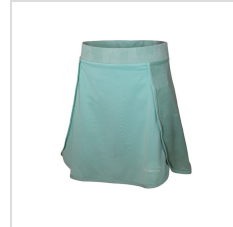
Icy Morn (22S19WB-312)