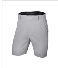
Cool Grey (22S15MB-019)