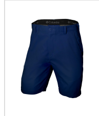
Collegiate Navy (22S15MB-464)