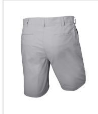
Cool Grey (22S15MB-019)