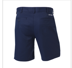
Collegiate Navy (22S15MB-464)