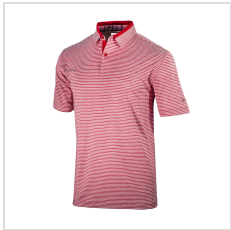
Intense Red (22S05MP-610)