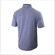
Collegiate Navy (22S05MP-464)