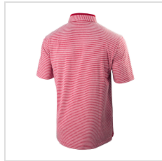
Intense Red (22S05MP-610)