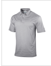
Cool Grey (22S05MP-019)