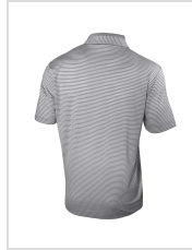
Cool Grey (22S05MP-019)