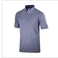
Collegiate Navy (22S05MP-464)