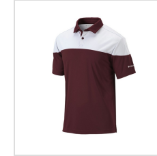
Deep Maroon (22S02MP-699)