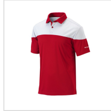
Intense Red (22S02MP-610)