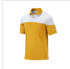
Aztec Gold (22S02MP-224)