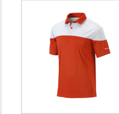
State Orange (22S02MP-842)