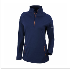
Collegiate Navy (22F25WL-464)