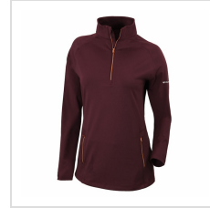
Deep Maroon (22F25WL-699)