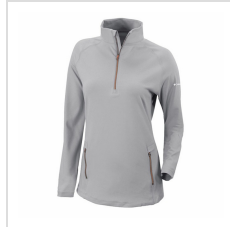
Cool Grey (22F25WL-019)