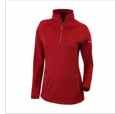
Intense Red (22F25WL-610)