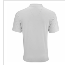
Vansport Marco Polo*