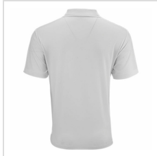
Vansport Marco Polo*