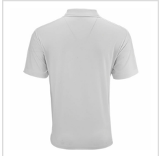
Vansport Marco Polo*