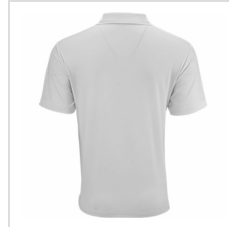
Vansport Marco Polo*