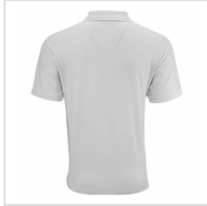
Vansport Marco Polo*