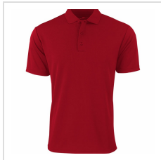
Sport Red (2000-SRE)