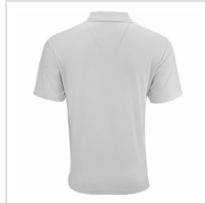
Vansport Marco Polo*