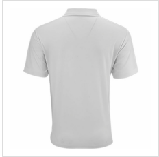
Vansport Marco Polo*