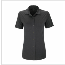
Dark Grey (1886-DGY)