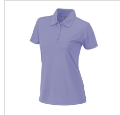
Frosted Purple (16S15WP-301)