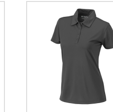
Forged Iron (16S15WP-895)