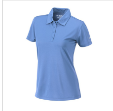
White Cap (16S15WP-450)