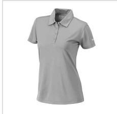
Cool Grey (16S15WP-019)