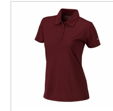
Deep Maroon (16S15WP-699)