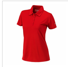
Intense Red (16S15WP-610)