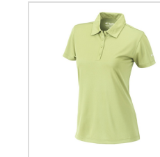
Spring Yellow (16S15WP-783)