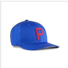
Royal Sapphire/Candy Apple (026133-13)