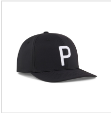
Puma Black/White Glow (026133-01)