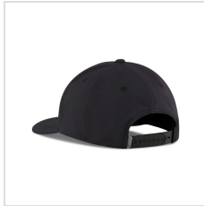
Puma Black/White Glow (026133-01)