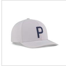
Ash Grey/Deep Navy (026133-04)