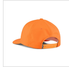
Rickie Orange/White Glow (026133-05)