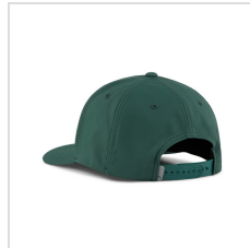
Dark Myrtle/White Glow (026133-07)