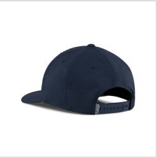
Deep Navy/White Glow (026133-03)