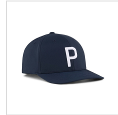
Deep Navy/White Glow (026133-03)