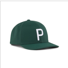
Dark Myrtle/White Glow (026133-07)