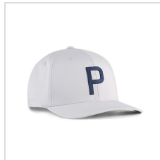
Platino Silver/Deep Navy (026133-14)