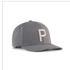
Shady Grey/Platino Silver (026133-