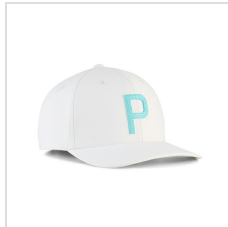
Warm White/Mint Jelly (026133-11)