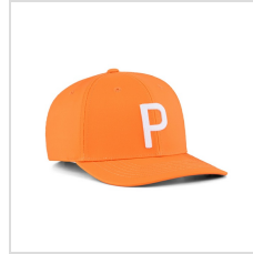
Rickie Orange/White Glow (026133-05)