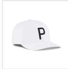
White Glow/Puma Black (026133-02)