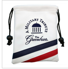
Vintage Leatherette Drawstring Valuables Pouch