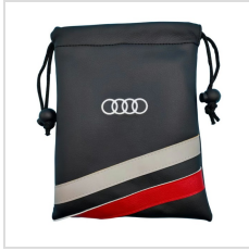
Vintage Leatherette Drawstring Valuables Pouch